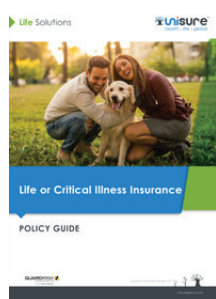
Life or Critical Illness Insurance